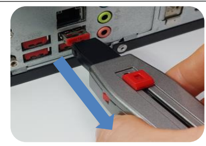
(3) Pull straight out to remove a Port Lock